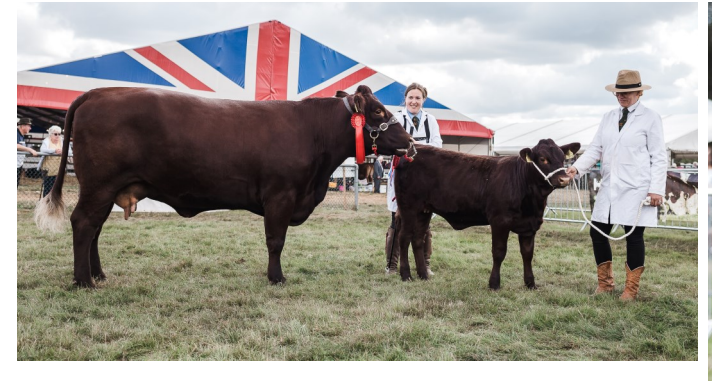
Breed Reserve: Montreal Poll Snowdrop 4th