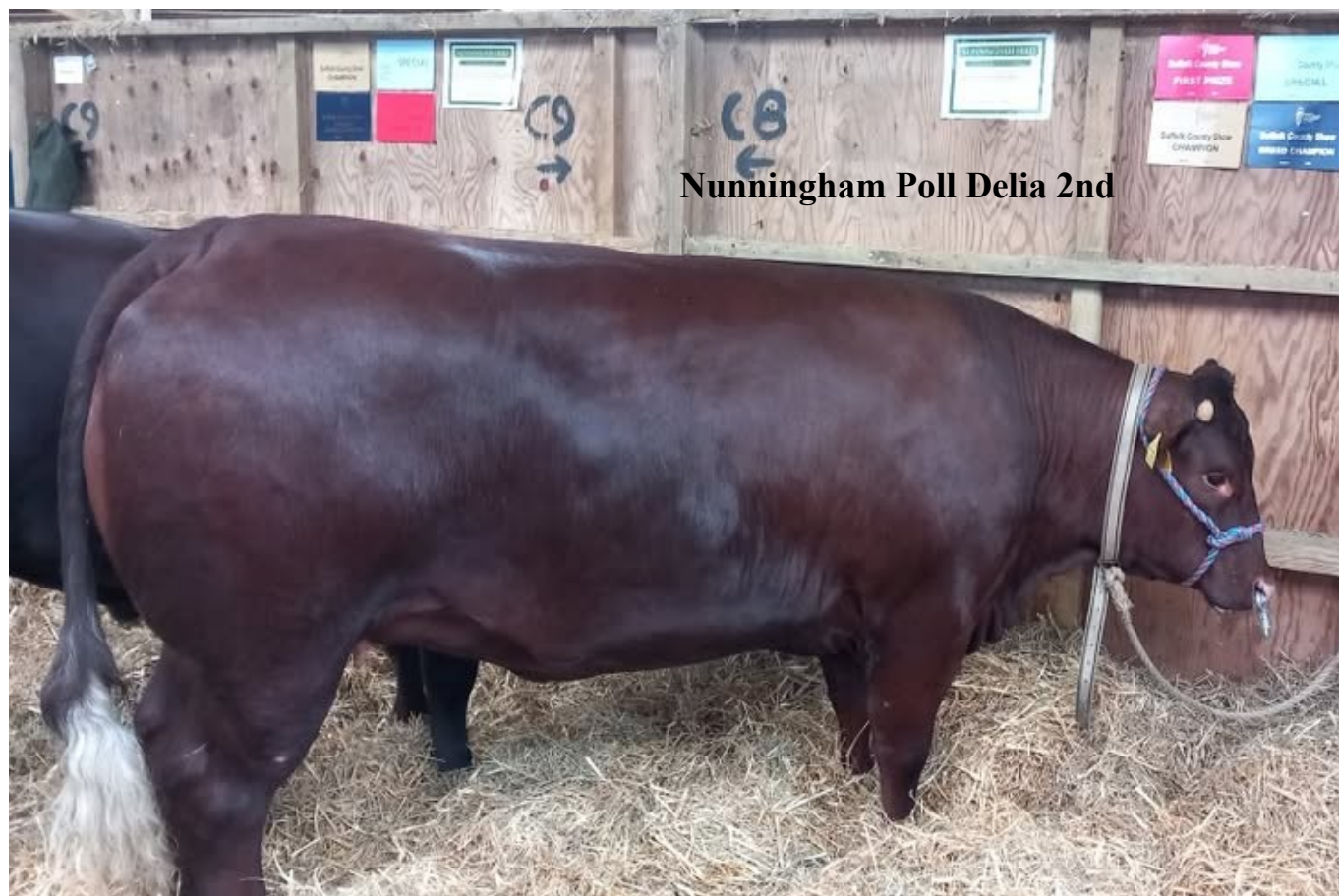
Nunningham Poll Delia 2nd